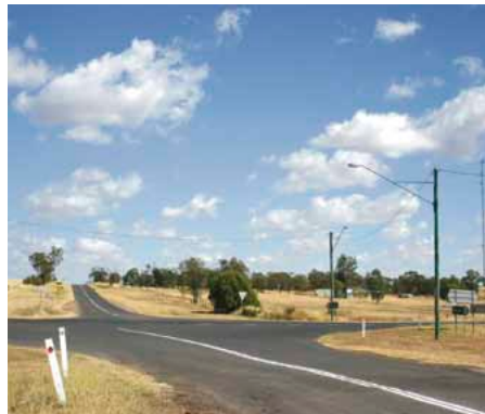
The natural ridge line will obscure the view of the mine from the town.

A Cultural Heritage Management Plan will be developed to assist in surveying work areas to identify and protect cultural heritage prior to any activities taking place.