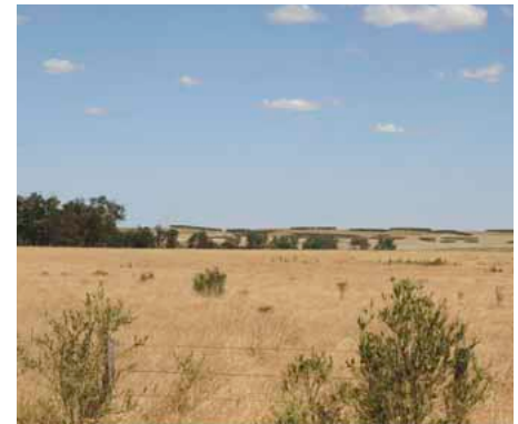
Predicted view of the proposed mine site from the Leichhardt Highway in year 30 of mine operations.

Two local bridges, at One Arm Man Creek and Woleebee Creek, will be upgraded and reconstructed. After extensive consultation with the community the proposed road closure timing is outlined in the table on the next page.