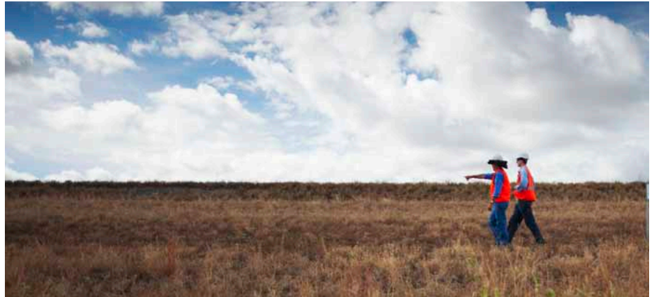
The Wandoan Coal Project has been established to undertake feasibility studies for an open-cut thermal coal mine.